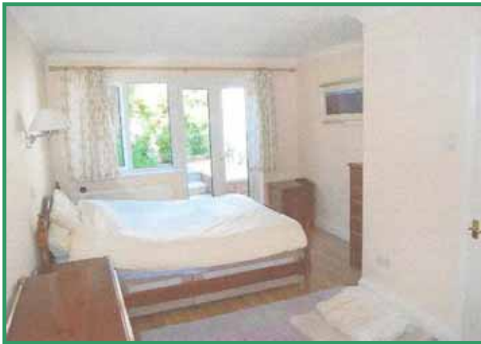
Double Bedroom With En-Suite Bathroom